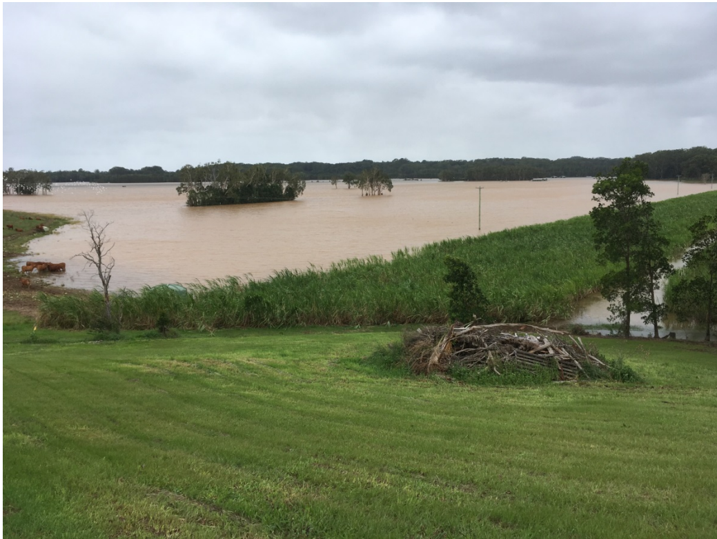
Photo 2 – Taken from a property on Wooyung Road looking south to the NBP camping area (31 March 2017)