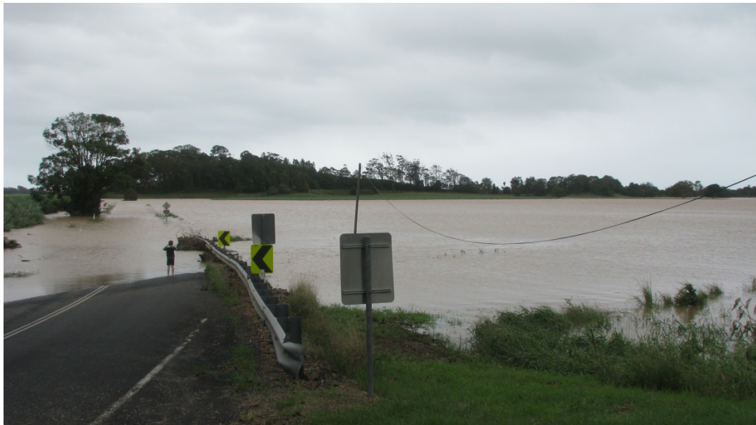
Photo 1 – Wooyung Road north west of the site looking north east (31 March 2017)

The safety of patrons is raised as a concern with regard to the evacuation of over 30,000 people from the site during a large flood event. Photos are provided below which indicate the level of inundation during the recent floods (31 March 2017) affecting the region.