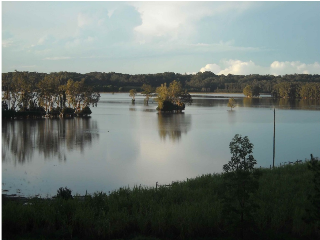
Photo 4 - Looking across to North Byron Parklands camping area taken from residence on Wooyung Rd (May 2009)