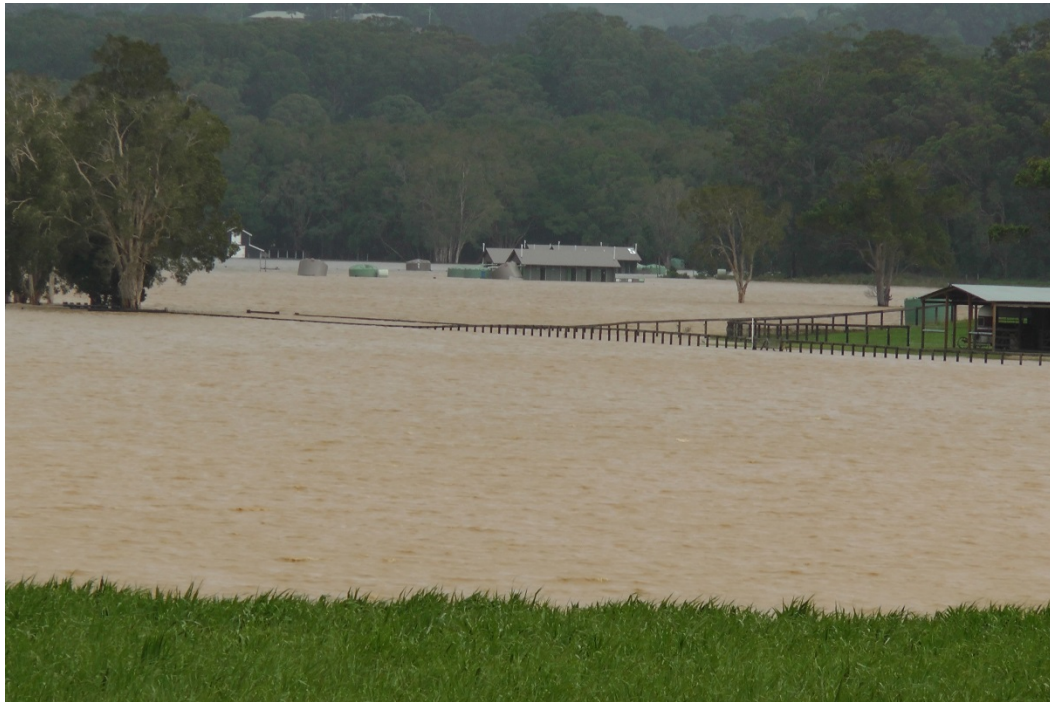
Photo 3 – Wooyung Road looking south towards toilets, Quaker hay shed and camping area (31 March 2017)

Taking into account previous concerns raised by NSW Police (with regard to the inability to evacuate the site within 8 hours), and the rapid rise of the floodwater as evidenced by the stream gauges (shown below in Figure 1), concerns are raised with regard to the proponent’s responsibility to ensure the safety of patrons, should a cultural event occur at the same time as a large flooding event.