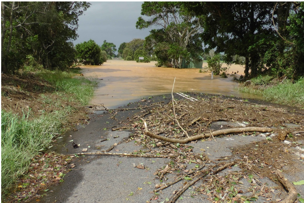
Photo 3 – Wooyung Road looking east to the junction of Ti-Tree Road (31 March 2017). Note – the water tank behind the vegetation at the edge of road has been washed more than 500m from the NBP camping ground.