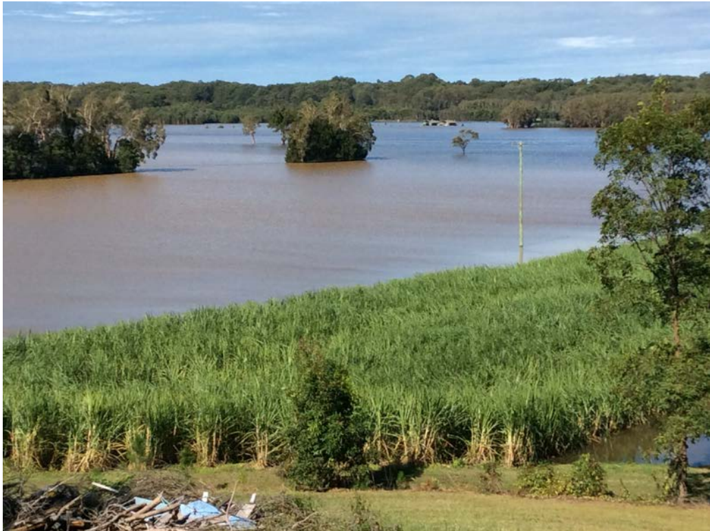
Photo 6 – Flooding impacts showing toilet facilities of campground (June 2016)