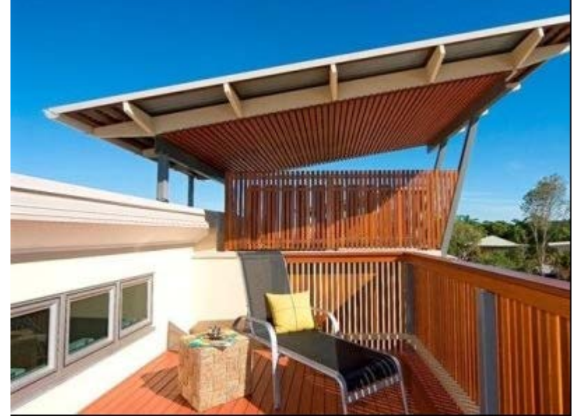
Figure 1: Successful roof top deck (stepped into the top storey, consistent materials and partially roofed for useability)