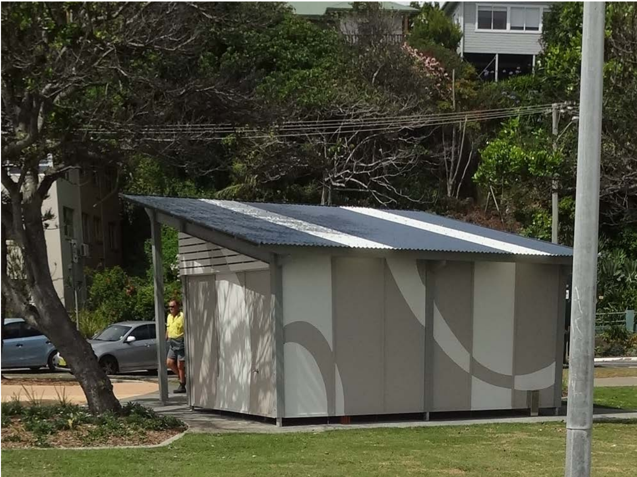
Figure 1: The rear of the existing toilet block where the proposed extension will be added.

Development approval for the facility expansion is required through a Part V Assessment for which the support of the Trust is sought.