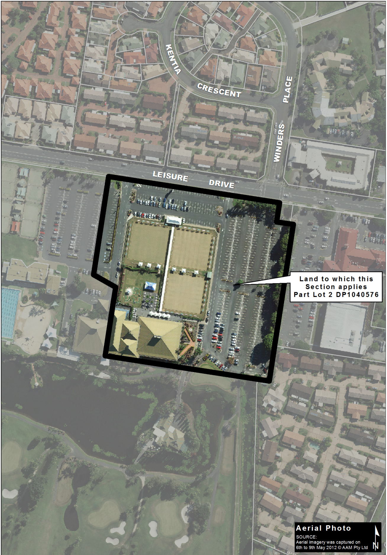
Figure 1.0 - Land to which this section applies.