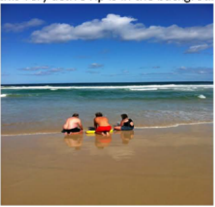
Photo 1: Lifeguard Paul Piccini Lulham with the two people who were caught in the rip. The mouth of this very active rip is in the background

At 4.30pm on the first day of patrol, the lifeguards responded to 2 people getting swept out in a strong rip due east of the Terrace St car park approximately 300m South of the flags. Mr Richard Adams was present at the time of the incident and took the attached photo (Photo 1)