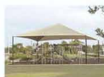
Playground Equipment & Shelter