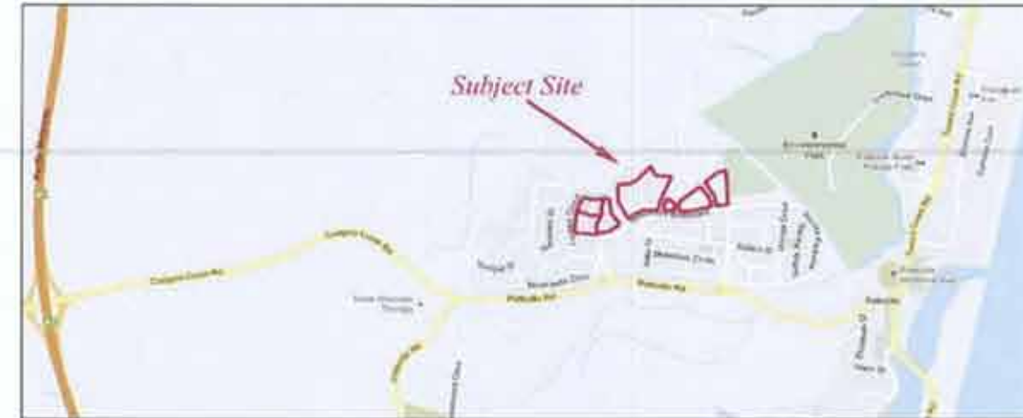
Map 1: Location of the subject site

The subject site, Lot 1147 on DP1115395, is located on Seabreeze Boulevard within Seabreeze Estate, Pottsville NSW.