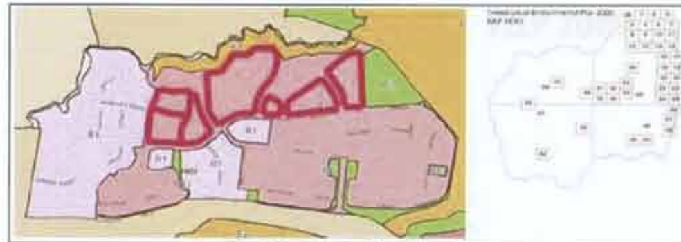
Map 2: Land Zoning Map - Sheet 27

This Landscape Statement of Intent has been developed in accordance with the concepts and the conclusions of the associated reports and plans for the proposed Seabreeze development. This includes the provision of maintained grassland in order to comply with fire management issues, requirements for open space, ecological enhancement, recreation and residential amenity.