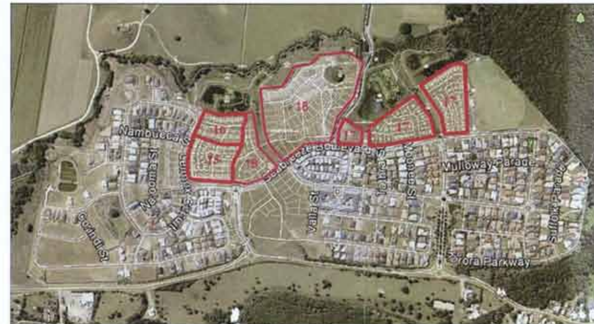
Figure 1: Seabreeze Stage 15, 16, 17 & 18