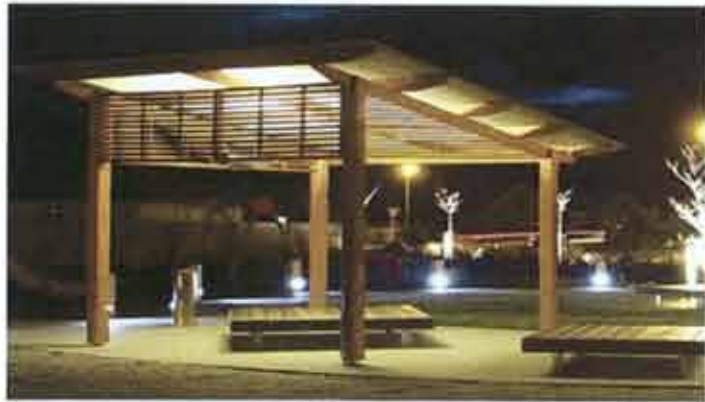
Example shelters and recreation areas