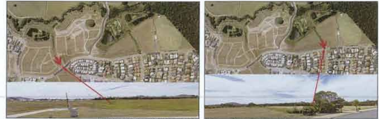
Existing Drainage Swales: Location of the existing drainage swales

The drainage swales currently contains a wide variety of weed species, this includes Cenchrus ciliaris (Buffel grass) Verbena bonariensis (Purple top) Conyza sumatrensis (Tall fleabane) Cyperus polystachyos (Bunchy sedge) Cyperus rotundus (Nut grass) Gomphocarpus physocarpus (Ballon cotton) Pennisetum clandestinum (Kikuyu grass) Setaria sphacelata (South African pigeon grass) & Typha latifolia (cumbungi).