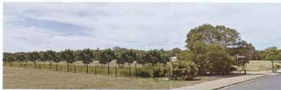
Concept of Fencing & Trees to be planted in existing drainage channel