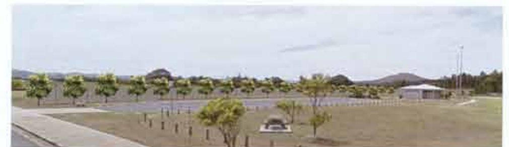
Concept of Fencing & Trees to be planted adjoining the existing sports oval