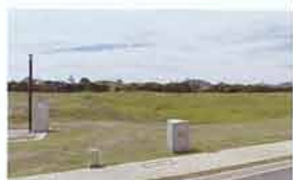
Existing Drainage Channel