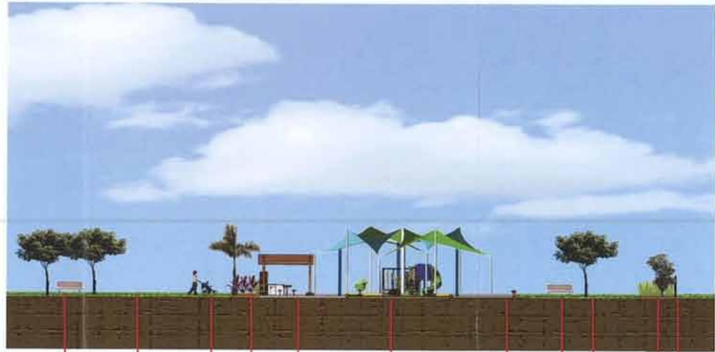
Perspective 2. Park Concept Cross Section