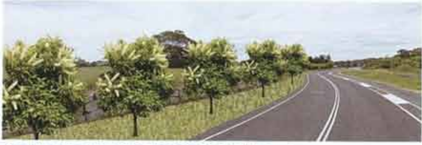
Concept of Linear green space along Tom Merchant Drive