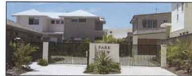
Photo 9: Landscaped entry statement to adjacent gated residential community

The landscape character of the surrounding residential development consists of a mix of native and exotic plants tolerant of coastal conditions. Feature plants with strong architectural foliage have been consistently used to provide a modern resort character to the area. Xeric species have been frequently utilised providing low maintenance water efficient gardens.