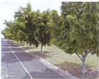
Street tree plantings