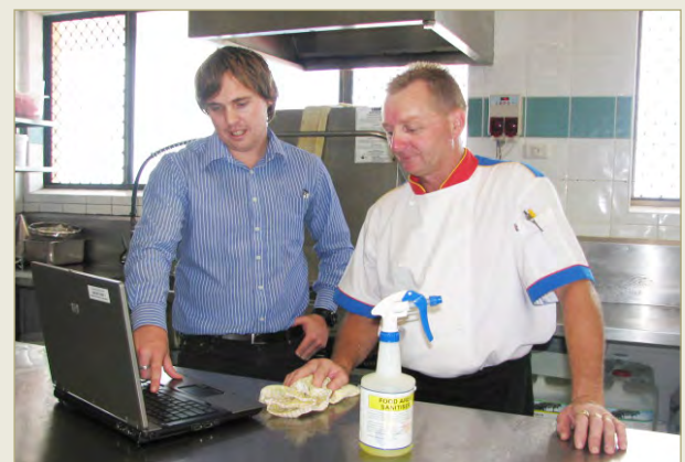
Council provides support and advice on regulatory requirements for events and festivals including food handling, licences and temporary structures.