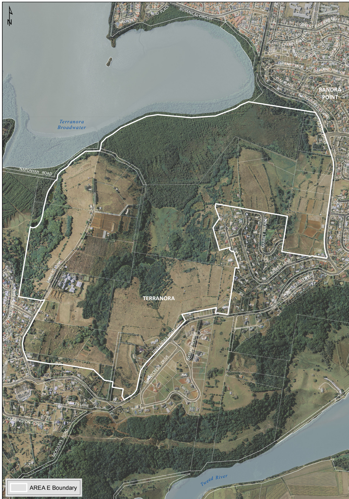
Figure 1.1 Area E Urban Release Area Code Boundary

This Code applies to all development on land situated within the boundary illustrated above.