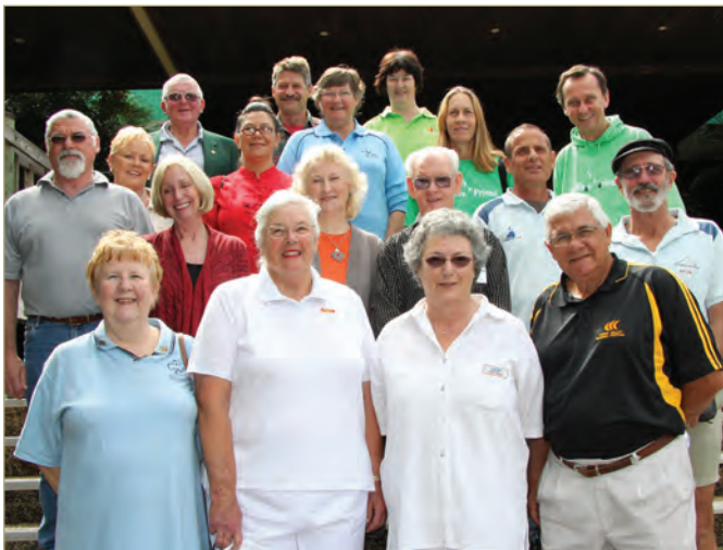
Recipients of Round 1 of Council's Festivals and Donations Funding - 2010/2011

Create a Tweed where people are healthy, safe, connected and in harmony with the natural environment, to retain and improve the quality of community life.