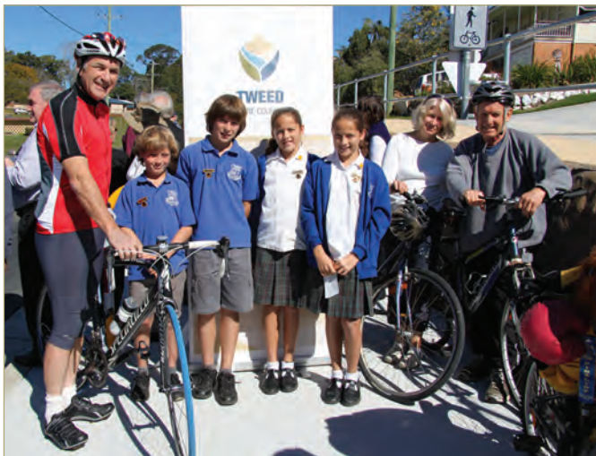
Official opening of Bray Park cutting cycleway 2010