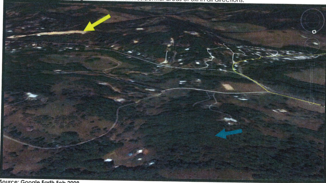
Figure 1. Elevation of quarry site in comparison to the higher elevated terrain located to the west. Location of quarry is indicated by yellow arrow. In comparison the proposed site, indicated by the blue arrow, has unobstructed signal propagation to the main residential areas of Uki in all directions.