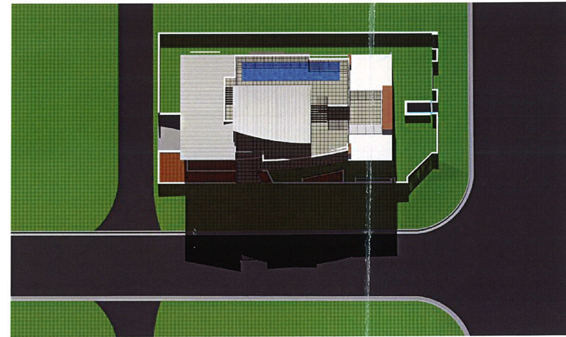
SHADOW 12pm JUNE 22nd 1:500 @ A3