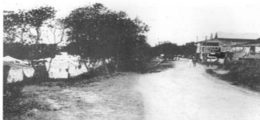
KINGSCLIFF c. 1920's. The "Grand Pacific Hotel" was built in Cudgen in 1904 and later moved to Kingscliff, then a small village but a favourite camping spot for locals and visitors.

2. Kingscliff Hotel was erected as the Grand Pacific Hotel in 1932, the license being transferred from an older hotel of the same name in Cudgen. Many of the building materials came from the dismantled Cudgen Grand Pacific. One of Kingscliff's oldest surviving buildings today, the hotel was renamed the 'Kingscliff Hotel' in 2007.