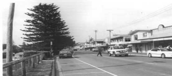
KINGSCLIFF 2000. Now popular with tourists and retirees, Kingscliff has a High School, a Library and many street cafes. The "Grand Pacific Hotel" in Marine Parade still caters for the thirsty.