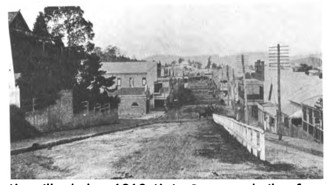
Murwillumbah c.1910 Main Street rebuilt after the fire of 1907

The Bundjalung People lived around this area for thousands of years before Europeans settled here. They were reported to be of much better physique than in other parts of the country. As there was an abundance of food and water in the area, the people led less of a wandering existence. They were healthy, strong and tall, and had more time for leisure and crafts than other tribes. Captain Cook sailed past this area in May 1770, identifying and naming two of Tweed Shire's most prominent features, Mt Warning/Wollumbin and Point Danger (Aboriginal area of Pooningbah). Mt Warning features as a prominent backdrop to Murwillumbah.