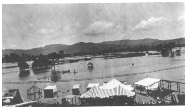
Murwillumbah 1917 – In flood, but the show goes on.

The opening of the railway in 1894 gave an enormous boost to the town and Murwillumbah was established as the service centre of the Tweed. Murwillumbah still has a picturesque, historic streetscape, both in and around the commercial centre.