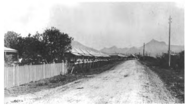
Murwillumbah c.1910 Condong Road, the main highway leading to Lismore

Many of the loggers, farmers and military used the Aboriginal men as a source of cheap labour, while the women worked as cleaners and childminders in exchange for sugar, tea and flour. Sadly their tribes had almost died out by the turn of the century.