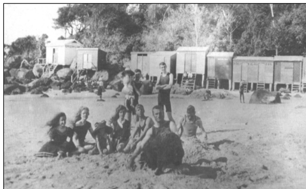
Tweed Heads 1909. Bathers in their woollen swimming costumes. Change huts in background.

A number of hotels were also very popular during this period including the Queensland Hotel, situated between Boat Harbour and Greenmount Beach, and the Hotel Tweed which was built on the Bay. The Hotel Tweed had a lookout on top which was used as a shark tower. Other popular hotels were the Hotel Coolangatta along the beachfront at Coolangatta, and the Pacifique Hotel at Tweed Heads.