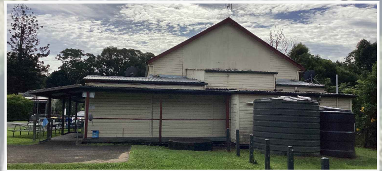
Back view of Crabbes Creek Hall