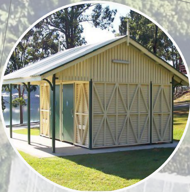
Indicative image of public toilet block Heritage style