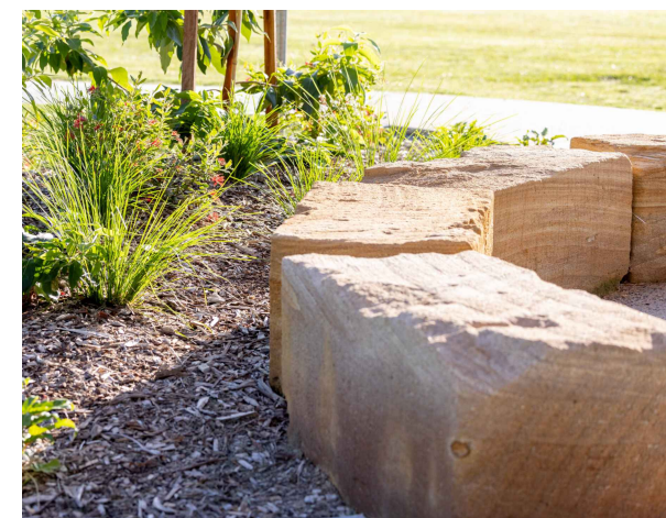
Sandstone retaining seat/walls