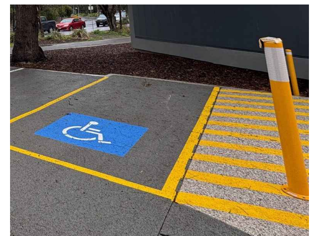
Designated Accessible Parking Bay (DAPB)