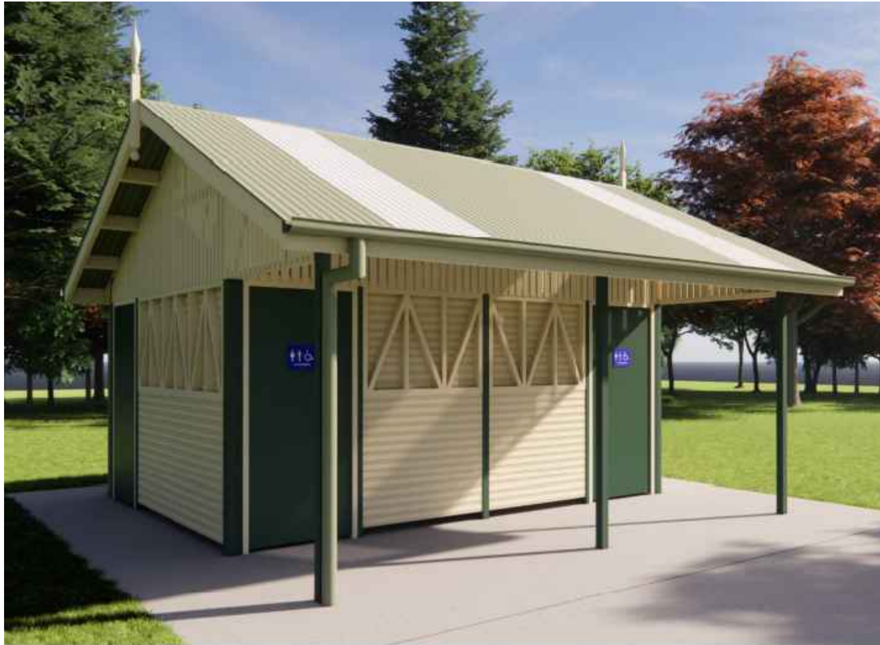
Heritage style toilet block with 2 unisex accessible cubicles