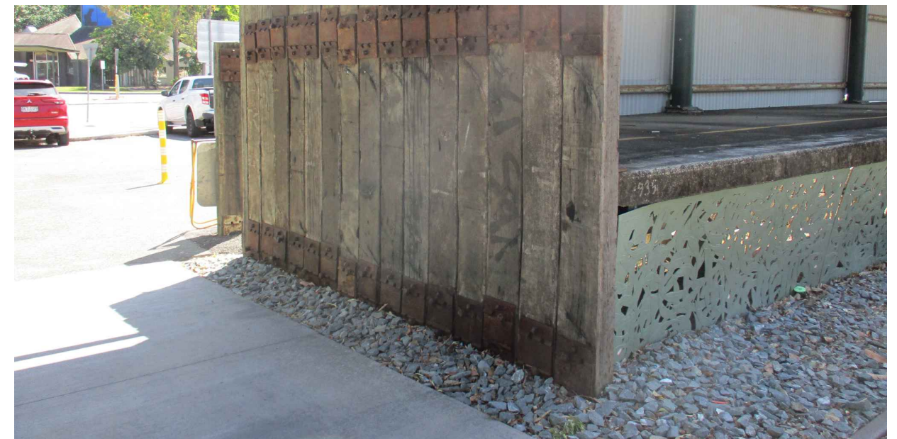
New southern entry point to NRRT to match design and finishes of northern entry