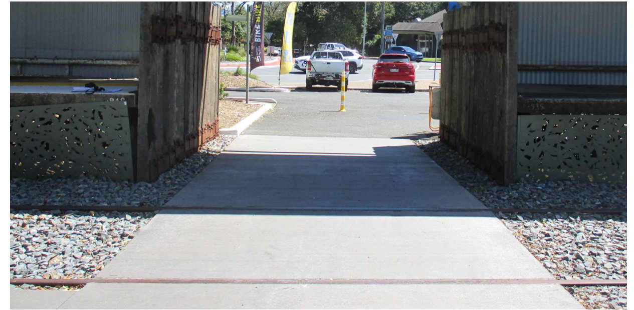
New southern entry point to NRRT to match design and finishes of northern entry