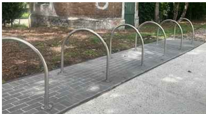
Bike racks and existing concrete finishes to be used