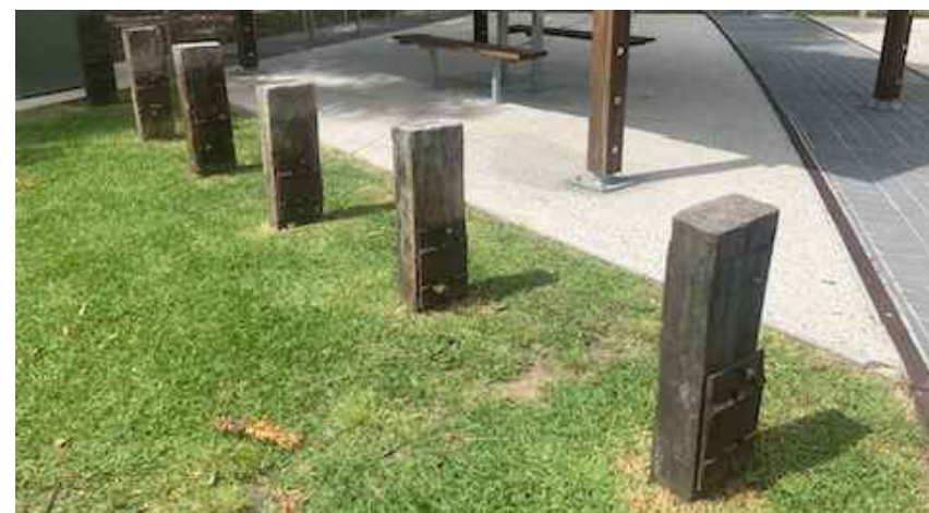
Vertical timber sleepers to select gardens and turfed areas