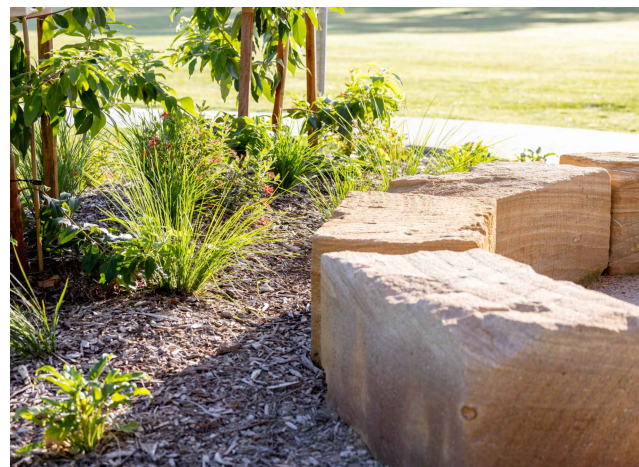
Sandstone retaining seat/walls