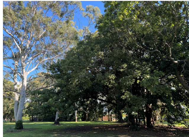
Large fig tree retained - Play space built around and under canopy