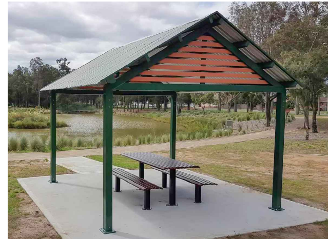
Accessible picnic table with shelter