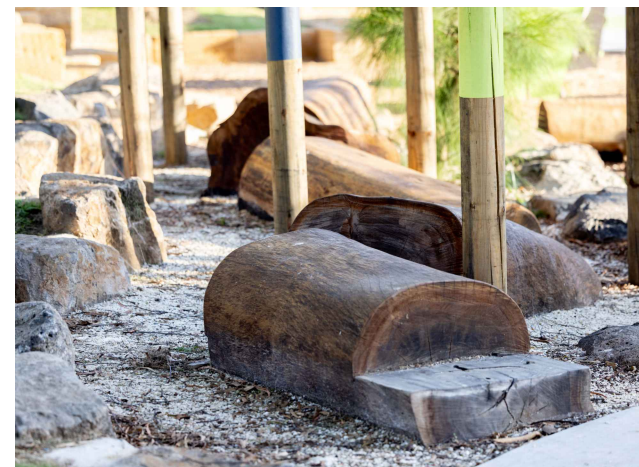
Nature play elements