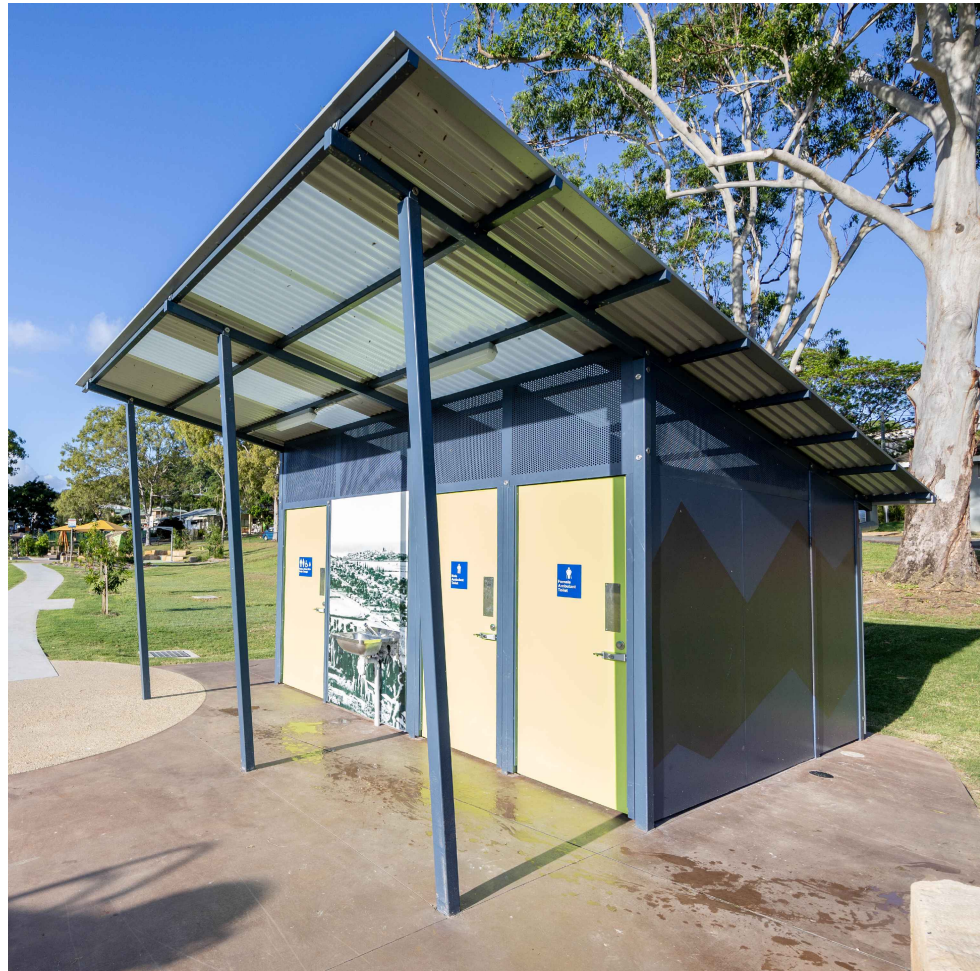
New toilet block including 1 unisex accessible cubicle, 1 male & 1 female ambulant cubicles

Play equipment (for 2-13year olds) with softfall - OPTION 3