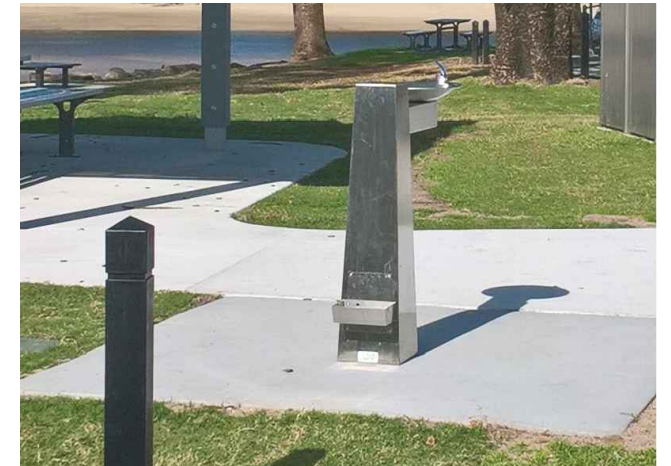
Accessible drinking fountain