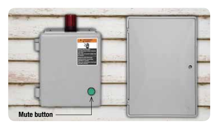
The pump station's control box normally is near the electricity meter box.